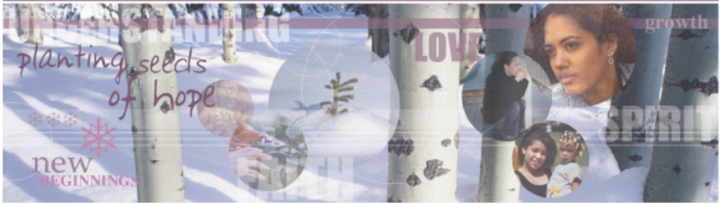
Girls Restored And Christ Exalted