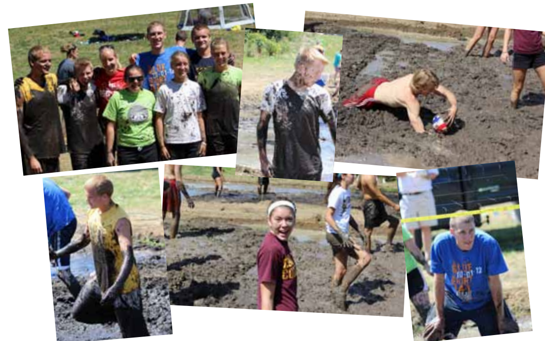
Well of GRACE Ministries would also like to thank all of our 2013 Mud Volleyball Sponsors!